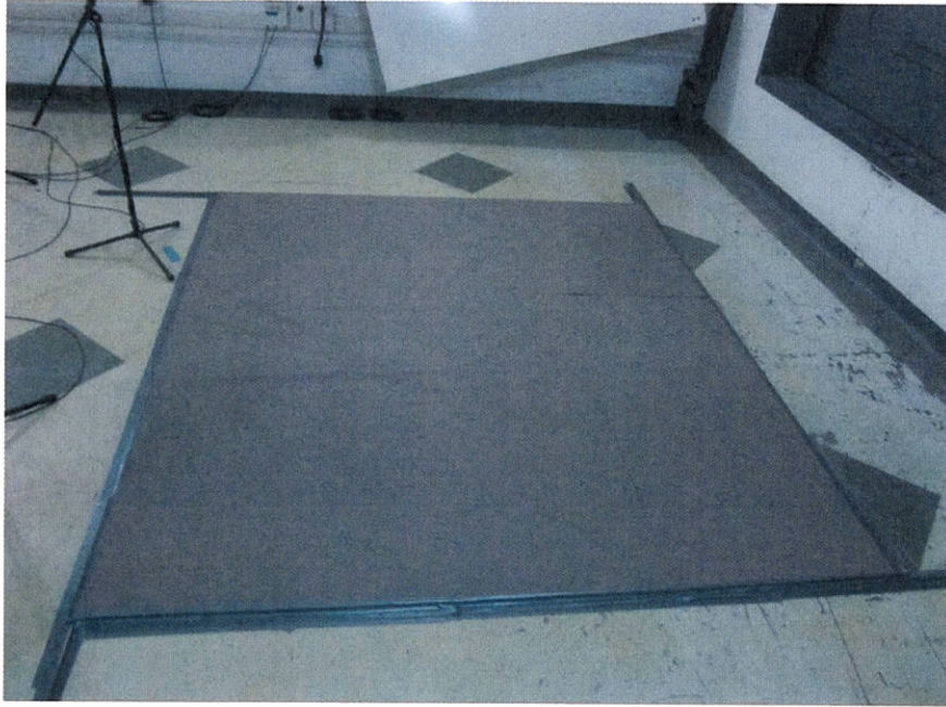
Installed Specimen Unison Suede